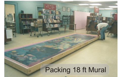
Packing 18 ft Mural

Reduce problems faced by the transport of art