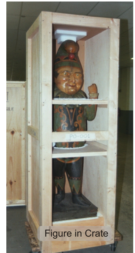
Figure in Crate

Crating Shipping Art Handling Display Furniture