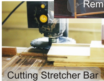
Cutting Stretcher Bar