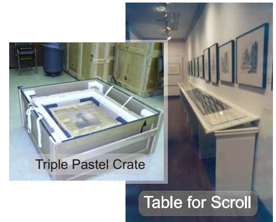
Triple Pastel Crate